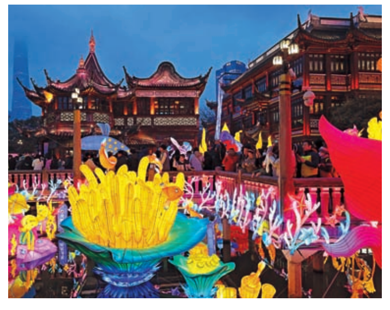
The iconic Zigzag Bridge at Shanghai's Yuyuan Garden is surrounded by fish and dragon lanterns.

The main lantern installation of this year's Yuyuan Garden Lantern Fair.