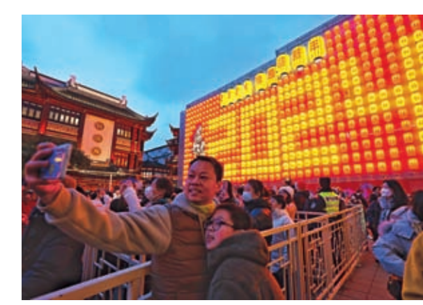
Visitors take photos at the Yuyuan Garden Malls on January 21.